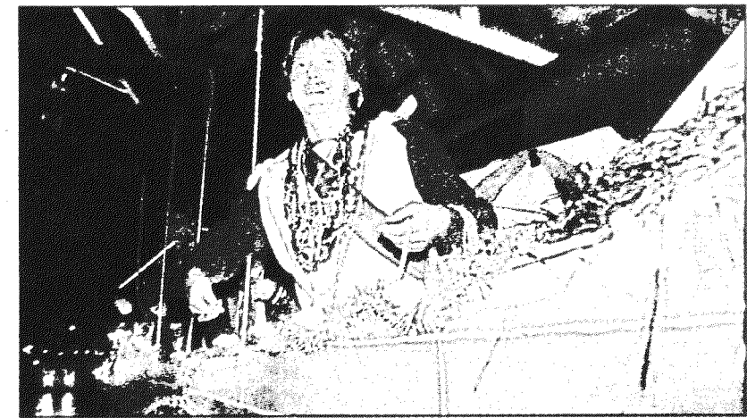
Beads are thrown to spectators as the Krewe of Aquarius' Fat Tuesday procession heads down The Strand Tuesday evening.